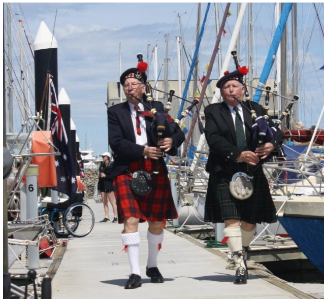
The Bag Pipers set the scene with an atmosphere and a tradition that was hard to ignore.

Opening Day was a huge success for PASC with over 100 people joined us in the club rooms for a sit down meal and many more members relaxed informally out on the verandah.