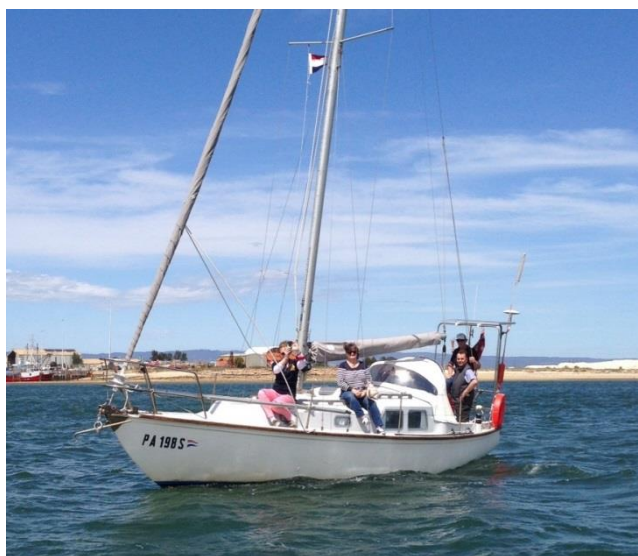
The sail pass went off without a hitch and the boats looked fantastic with decorations and crew dressed to match the vintage nautical theme of the day.